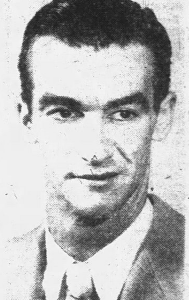
Who is he?

A young man in search of his past today appealed to "anyone who may know me to help me go home."