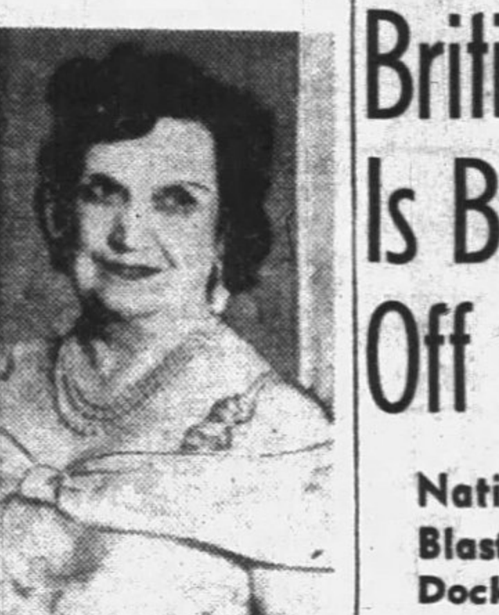
Mrs. Perle Mesta, nominated by President Truman to be minister to Luxembourg.

CHANG TO RETURN CANTON, June 21.—(AP)—Generalissimo Chiang Kai-shek will return to public life to help direct Nationalist China's struggle against the communists.